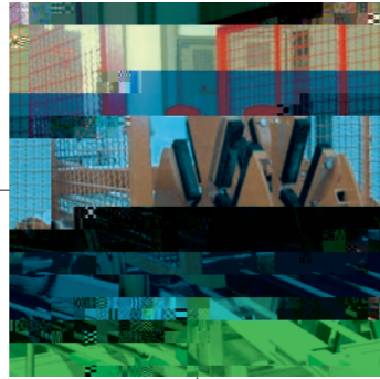
Star-shaped turning device